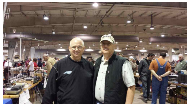
RARSFEST: April 2nd, 2016