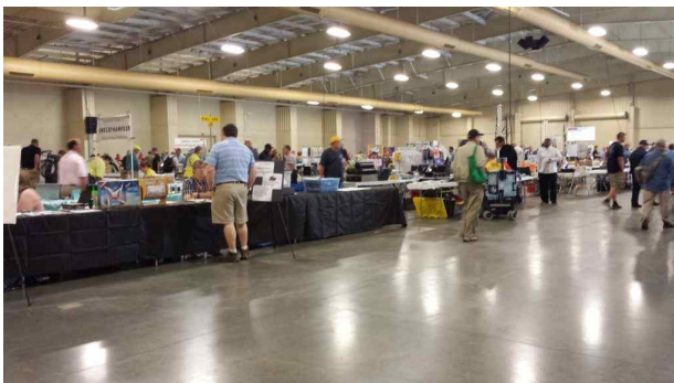
Charlotte Hamfest: March 12th, 2016