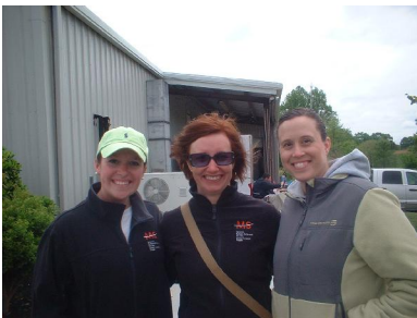
Three Pretty Ladies